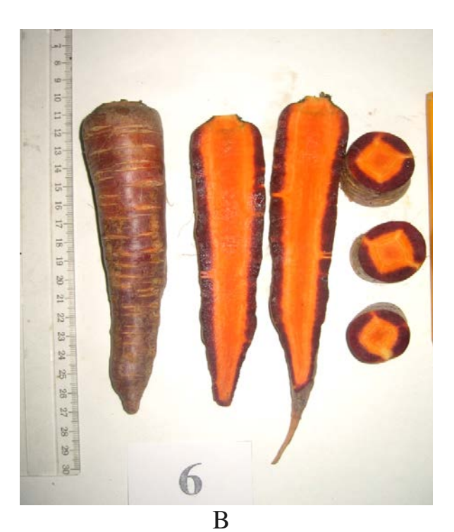
Fig. 1. General view of the of roots hybrids Yellowstone F_1(A) and Purple Haze F_1(B)

Results of research. Results comprehensive assessment of fresh carrot shown in Table. 1.