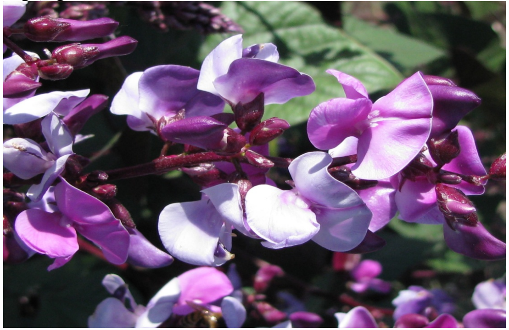
Fig. 1 – The mass flowering of dolichos plants

It was determined that the duration of the period from the germination till the beginning of flowering during the different schemes of sowing was between 39 to 41 days. Early-ripening was characterized the variety with the biggest density of sowing (71 thousands pcs./ha), which had a duration of the period 39 days that is 2 days less than control. Unripe beans-blades in a phase of technical maturity have beautiful burgundy color. Dolichos differs by long term of flowering with beautiful purple flowers from June until autumn frosts. All this suggests the possibility of their use in gardening (Fig. 1).